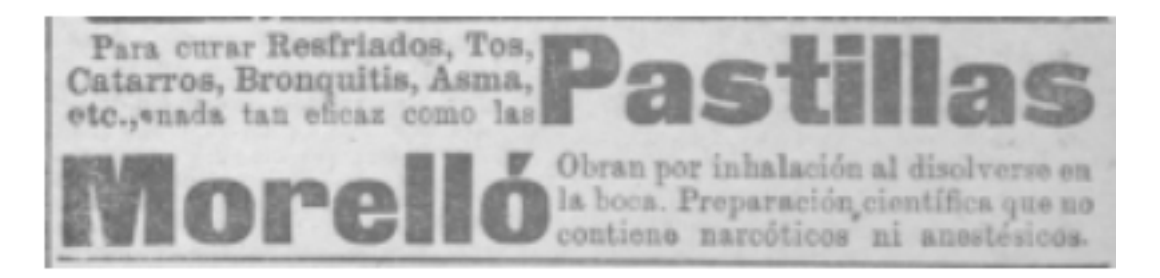
Figure 2. Morelló Pills for respiratory diseases announcement.

conditions. The phenolic syrup of Vial, had "safe effectiveness in cough, cold, catarrh, bronchitis, flu, hoarseness. Pills that were offered only for the cough, and some for the breath were more habitual, like the pills "chloro-potassium with cumin and menthol of the Pinedo", made in Bilbao by the pharmacy of the same name, whose announcements replaced the cumin by the cocaine in 1905.