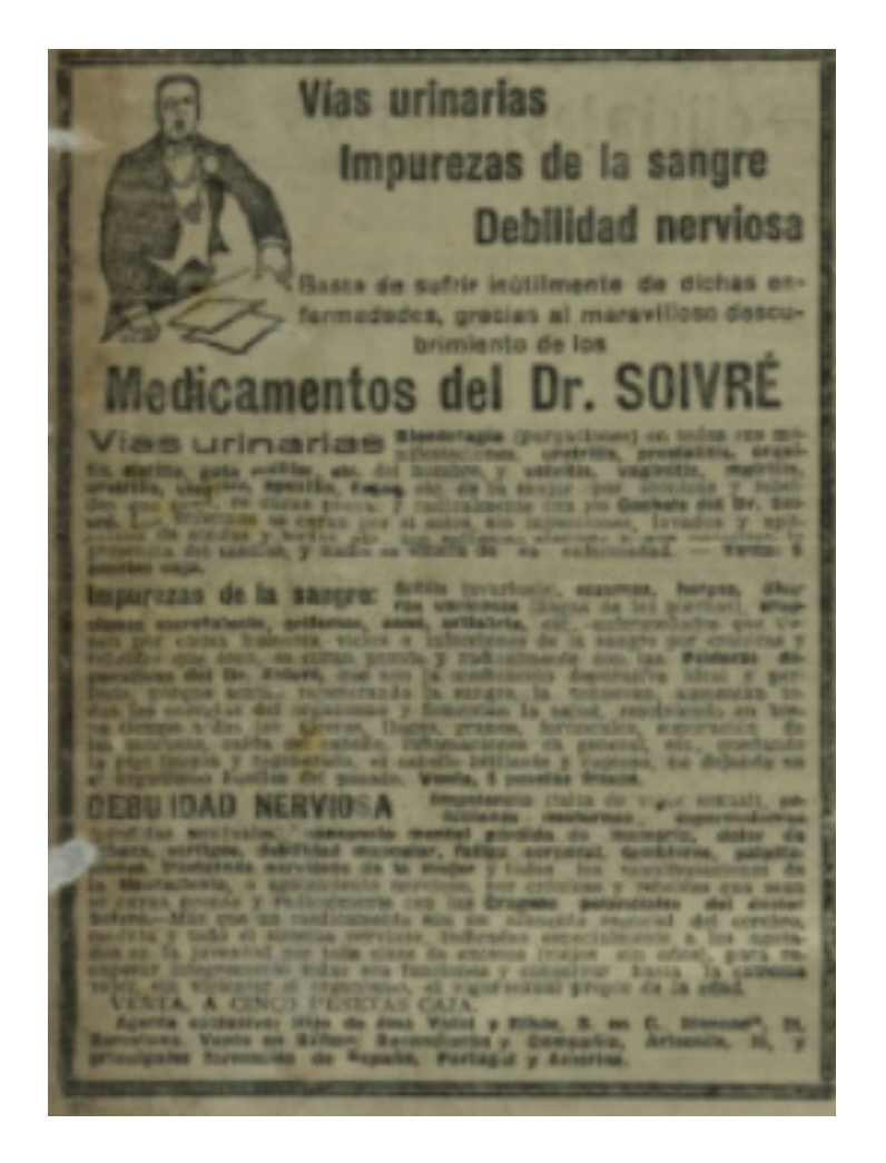
Figure 3. Dr. Soivré's Medication Announcement.

But the main difference was found in the large number of doctors' advertising. That day 25 did, including 7 midwives. Almost half, 12, included in the announcement allusions to venereal diseases: "urinary tract, secret, skin," "painless injections of 914," "syphilis-venereal-skin," "treatment of syphilis by neo save". Perhaps venereal diseases had been less well controlled in the poorer sectors, to whom the new remedies based on arsphenamine and new technologies were aimed, which required specific medical control.