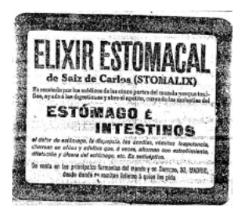
Figure 1. Announcement of Saiz de Carlos' Stomach Elixir

Judging by advertising continuity, in the first two decades of the 20th century, some purifying or reconstituting agents were a must in the medicine cabinets. The Pills and Blancard's Syrup - prestigious since the 19th century, composed by iron iodide, were still used against anemia -, the Pautauberge Solution, the Paglian Syrup, the Aroud Wine - with iron and quinine, the Deschienes Hemoglobin Syrup, Falières Phosphatine - a nutritional supplement for children - stood out, Brandeth pills - of great American success, had a strictly vegetable composition, "always effective cure chronic constipation"... and diverse digestive ailments, besides purifying the blood - and Ambrina, announced for the arthritic ones, fought a wide range of ailments, as it specified: "chilblains, burns, varicose ulcers, rheumatism, gout..."<sup>36</sup>