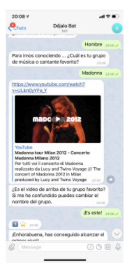
Figure 3. Real chatbot dialog screen on the first day when you explore and check out our favorite band.