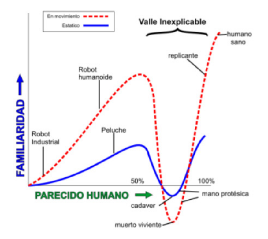
Figure 1. Representation of the "disturbing valley" described by Masahiro Mori.

However, rejection is not always generated. Researchers like Hiroshi Ishiguro, director of the Robotic Intelligence Laboratory at Osaka University, have created their robotic clone equipped with artificial intelligence that acts as a double of its creator in the Geminoid project.