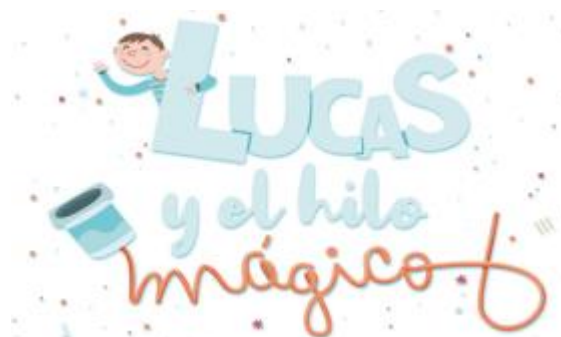
Figure 5. Cover of the story "Lucas and the magic thread"