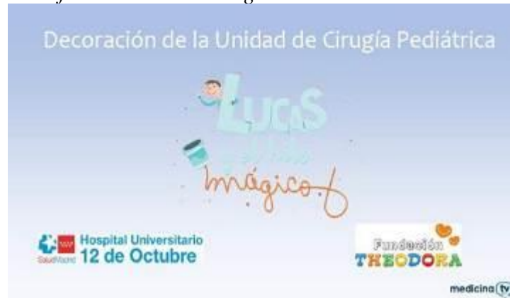
Figure 2. Presentation of "Lucas and the Magic Thread".

But the staging of the story does not end at the doors of the operating theatre, it continues even in the surgical area, with illustrative vinyls visible to the patient at all times, and from the entrance to the area, to the Post-Anaesthesia Recovery Unit (URPA).