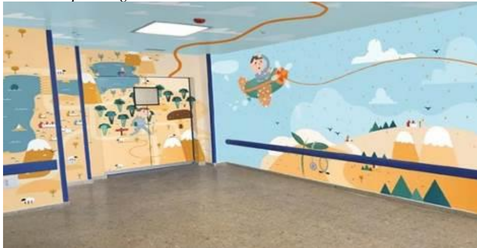
Figure 7. Paediatric pre-surgical area