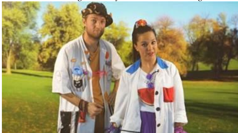
Figure 1. Clowns of Theodora narrating the story "Lucas and the magic thread".

Alliances are created with two non-profit organisations that collaborate with the Hospital's CSR Service, specifically with the Theodora Foundation and Medicina Televisiva. Several meetings were arranged to establish channels of collaboration. The representatives of the Theodora Foundation proposed a story entitled "Lucas and the magic thread", the development of which could be implemented as an entertainment tool during the pre-surgical process. Medicina Televisiva, for its part, will make a video in which two clowns from the Theodora Foundation tell the story.