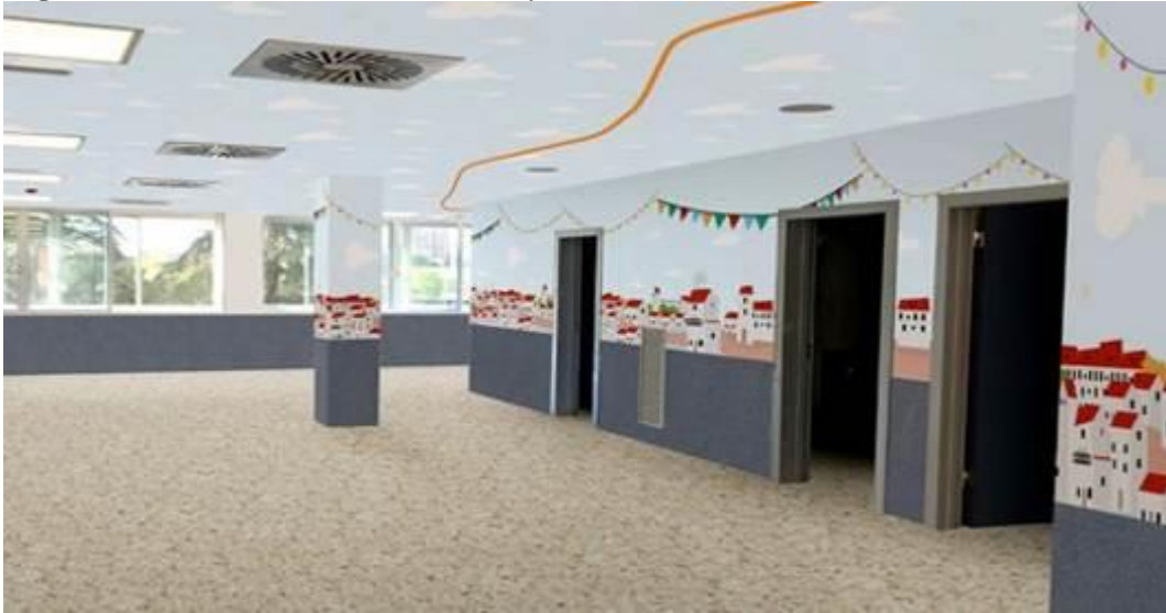
Figure 12. Post-anaesthesia Recovery Unit (PACU)