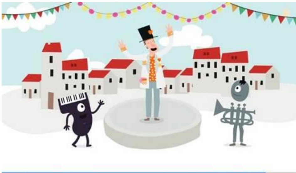
Figure 9. Doctor Sonrisa in the town square, with the band