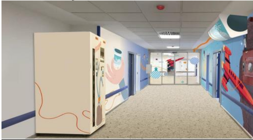
Figure 6. Entrance to the surgical area