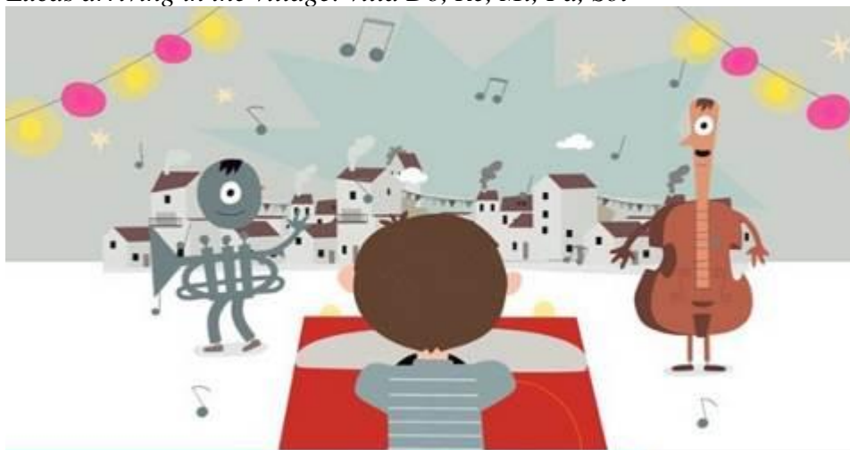
Figure 8. Lucas arriving in the village: villa Do, Re, Mi, Fa, Sol

The orderly, after checking with the pre-anaesthesia nurse the patient's identity with a double confirmation, and accompanied by the TCAE of the pre-anaesthesia area, will transfer the patient to the operating theatre. During the transfer, the orderly and the TCAE will continue with the distraction programme based on the story of "Lucas and the magic thread". To do so, they will refer to the ceiling decoration, with images of different musical instruments (a lady violin on the ceiling), and that of the walls, with the painting of a city representing the village Do, Re, Mi, Fa, Sol with instruments that sing and dance with it.