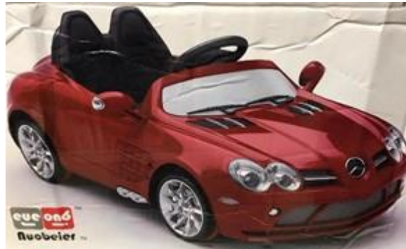
Figure 11. Car for transferring paediatric patients to the operating theatre.