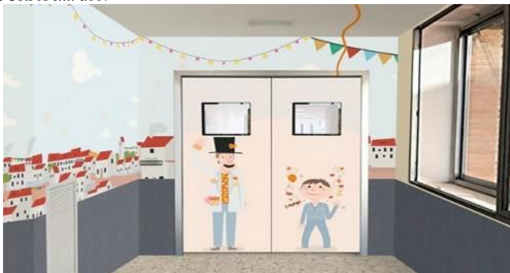
Figure 13. URPA exit door

The patient will be given a personalised "medal of courage" with his or her name on it. And this closes the circuit and the process.