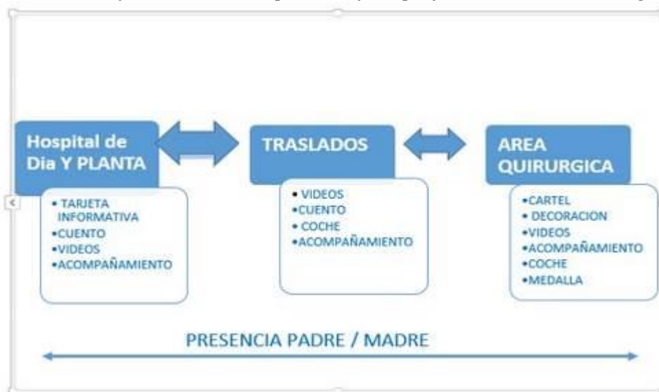
Figure 3. Circuit of the intervention process of the project "Lucas and the magic thread".