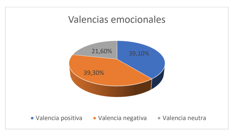
Figure 3 . Percentage of emotional valence.