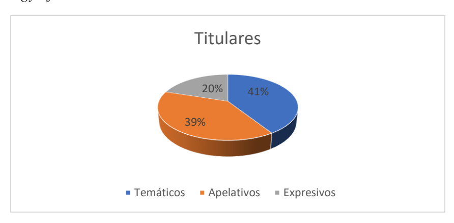
Figure 2 . Typology of holders.

The following figure shows the characteristics of the headlines: